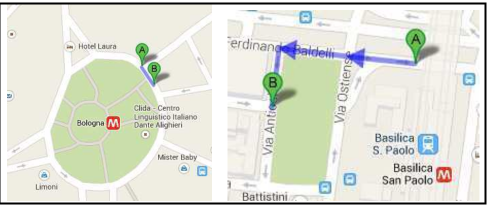
FROM METRO SAN PAOLO TO TENNIS TABLE FIELD (ITIS ARMELLINI)